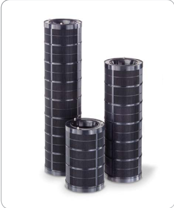
10", 18" and 24" lengths shown. 10" (reduced capacity) only available by special order, contact factory.

Refillable high capacity sorbent cylinders remove offensive gaseous contaminants or reduce expenses associated with ventilation air.