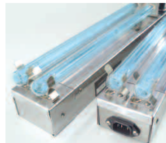
Hardwire fixtures are also available