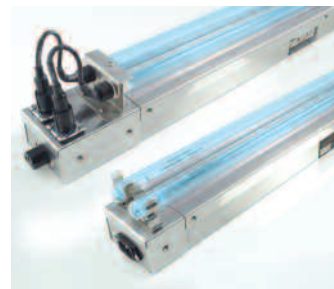
Connect multiple fixtures to one power source