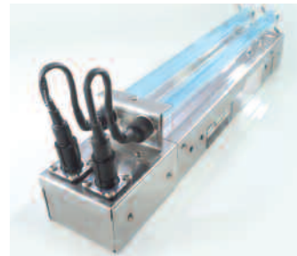
Water-tight lamp connection

INDEPENDENT TESTING: Units are tested in accordance with the general provisions of IES Lighting Handbook, 1981 Applications Volume, and provide output per 1" arc length of not less than 11.7 \mu W/cm 2 at 1 meter in a 400 fpm airstream of 45° F.