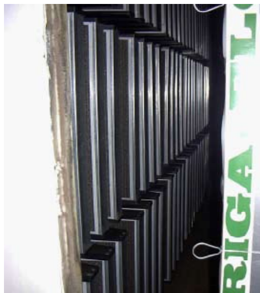
Built-up filter banks with 30/30® pre-filter, Citysorb carbon filter & Riga-Flo® 200 MERV 14

The results of the temperature monitoring showed consistent temperature levels at the front location and more varied levels at the rear location. While temperature levels measured at the front sampling location were within the CSA (Canadian Standards Association) recommended range of 22 to 24°C, temperature levels at the rear monitoring location varied from 20 to 25°C during the three days of measurement. Indoor relative humidity levels were also within both the ASHRAE comfort range and the CSA comfort range. These results indicate adequate thermal control in the PACU during the period of testing.